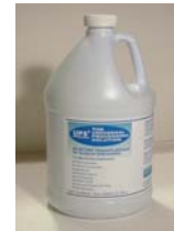
all-in-ONE easy FOAM-it, Flat all-in-ONE D-Zyme Cleaning Sponges, Tubular all-in-ONE D-Zyme Cleaning Sponges, all-in-ONE Enzyme Detergent Cleaners.

The highly concentrated all-in-ONE cleaners are aggressive against your most difficult cleaning challenge and guaranteed to be safe for all types of metal, rigid and flexible scopes, lenses, microsurgical instrumentation and reprocessing equipment.